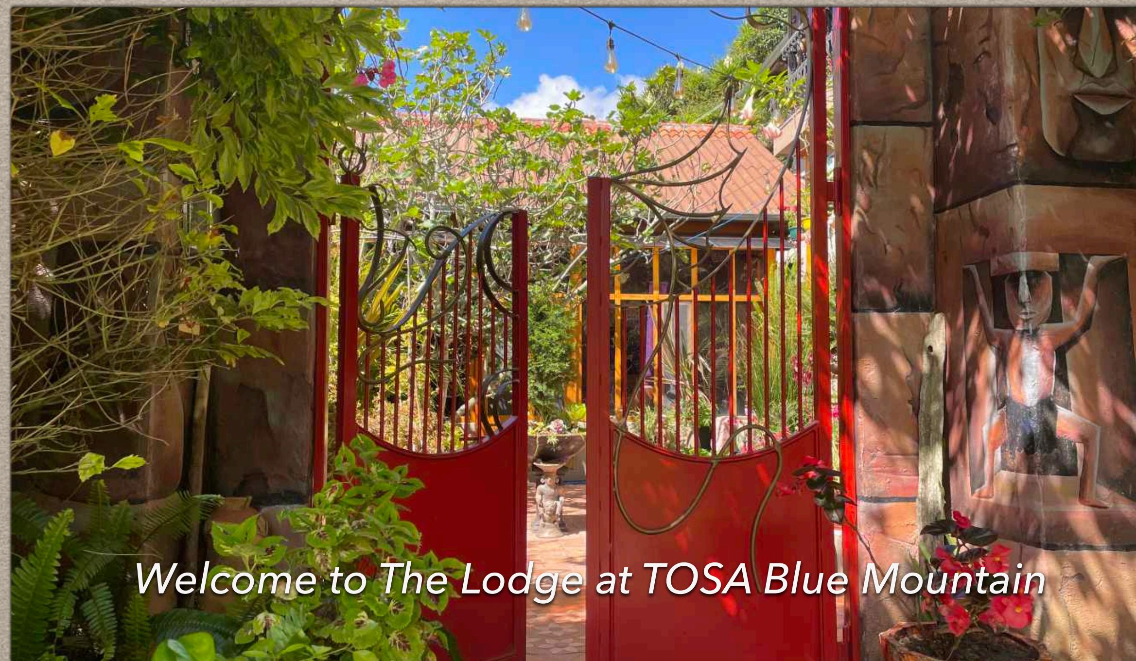
Welcome to The Lodge at TOSA Blue Mountain