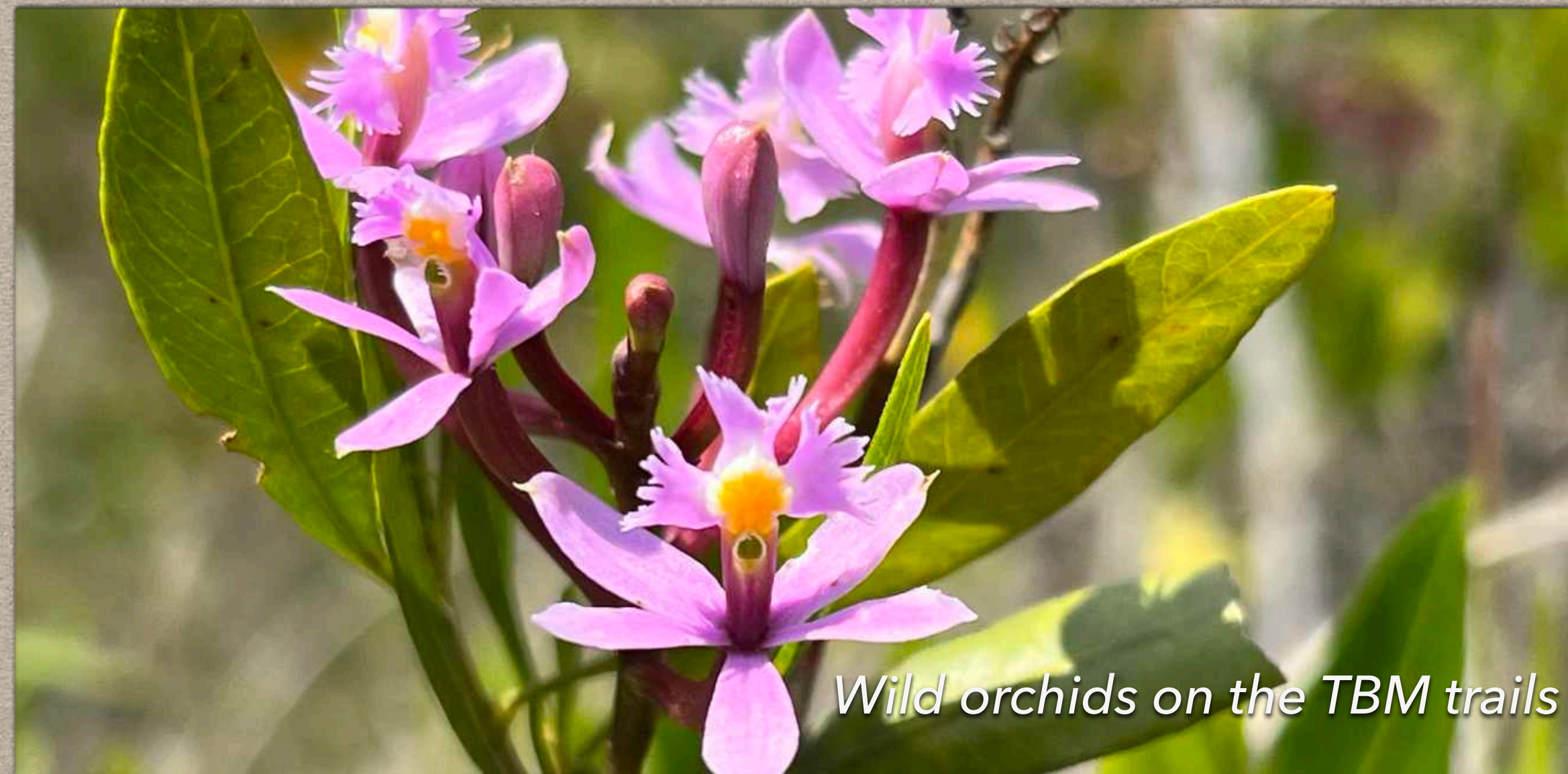
Wild orchids on the TBM trails