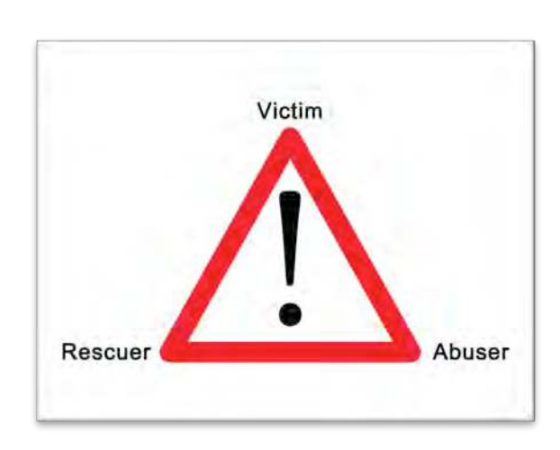
To 'pop' requires that we move through a momentary void, and that is threatening to the ego.

Each trigger provides a stimulus to "pop or drop". That is, do we grow in awareness and emotional healing or do we 'drop' back into an egoic comfort zone? Do we engage the Victim triangle?